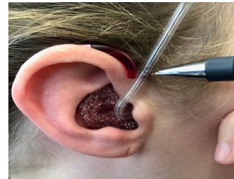
4) Use a pen to mark the tubing