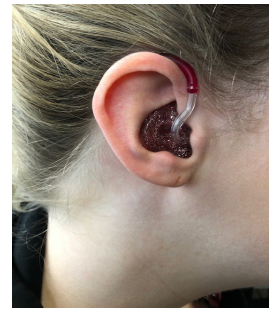
7) Put the hearing aid on your child's ear