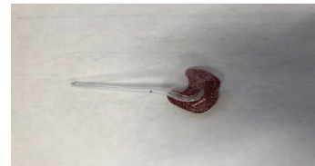
1) Put the new earmold with the long tubing into your child's ear