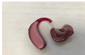
6) Attach the trimmed earmold to the hearing aid.